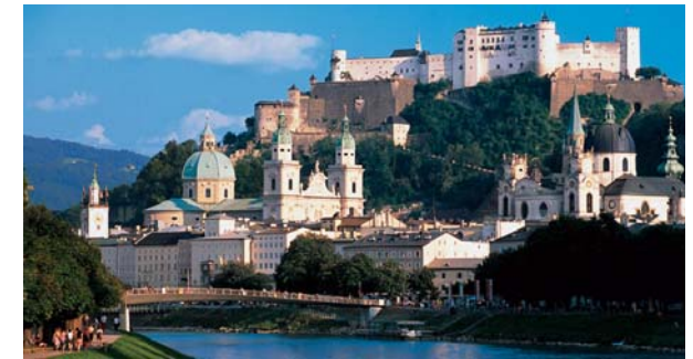
City of Salzburg

If you would like to participate as an exhibitor or sponsor please ask for further information.